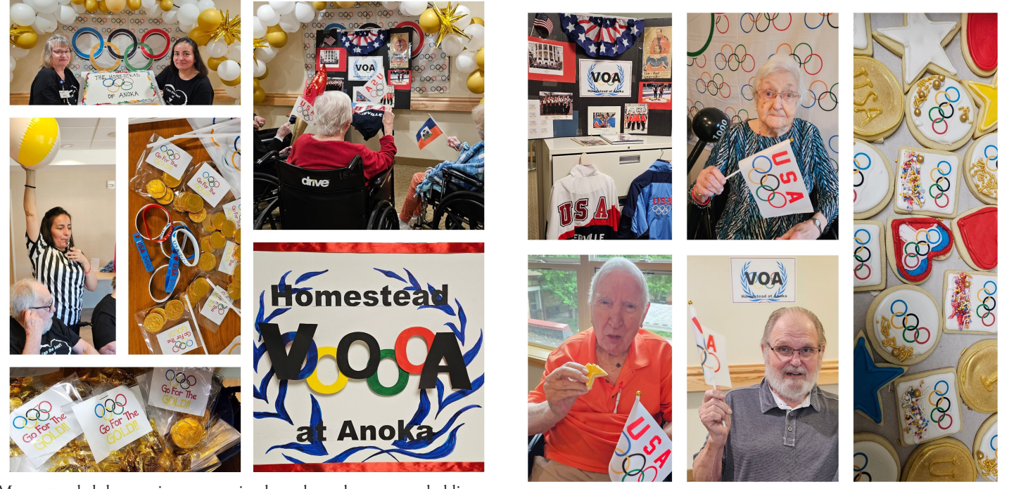
Many attended the opening ceremonies throughout the campus - holding flags, treats and shouting "VOA"!